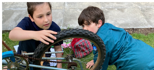
It's only flat at the bottom.