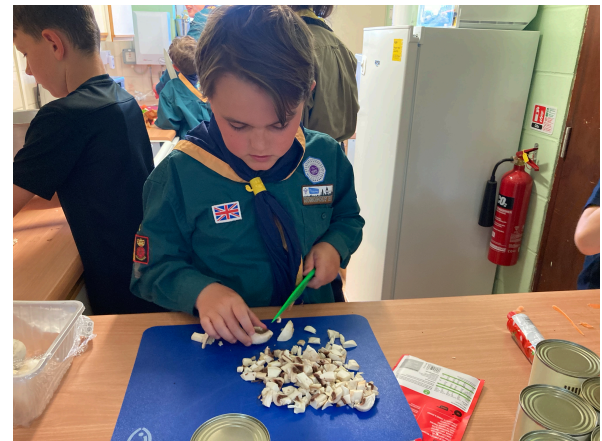
Skills for life